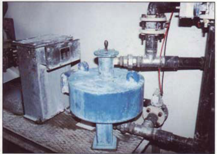
One of the many applications for the Mastermag High Intensity Filter, shown above in a typical ceramic sliphouse.

The Mastermag filter consists of highly efficient computer designed coil into which a canister containing a stainless steel matrix is inserted. The slurry is pumped through the matrix which allows greater control of particle residence time. Magnetic contaminants are